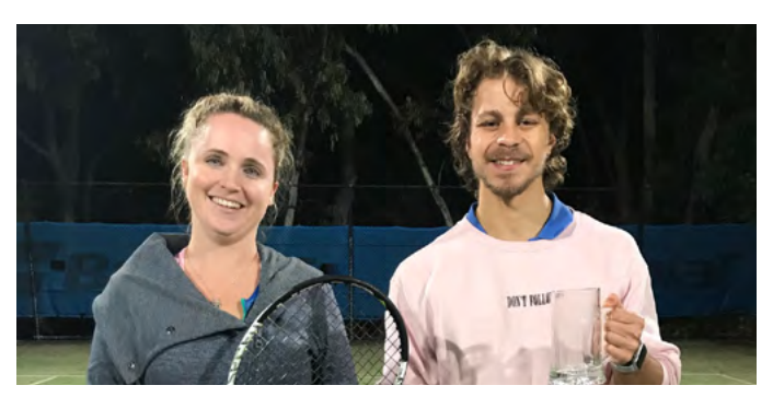
Always Warming Up, "Elite" winners of Tuesday Night

This comp is the biggest & strongest comp in the Association, with up to 28 teams across 5 divisions, using all our courts at Mills Park, 3 courts from Berowra, and even having to hire an extra court from KWTA for the Autumn comp. The restriction of only male players being allowed to play was removed this year, which contributed to the boost up to 28 teams. Seven ladies so far have taken part in the comp, four of them have gone on to also represent HKDTA playing in the Open Ladies Division of the Interdistrict Competition.