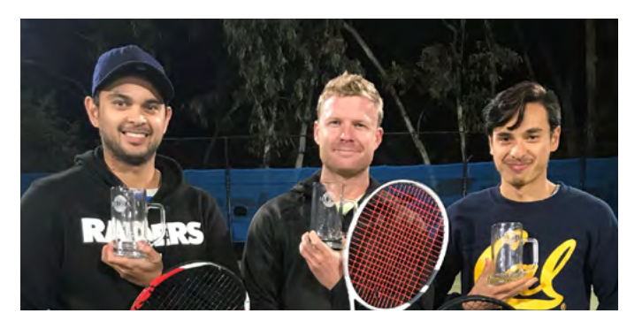
Berowra Boyz, "SuperComp" winners of Tuesday Night