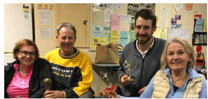
Silvertails, winners of the Thursday Night Autumn Mixed comp