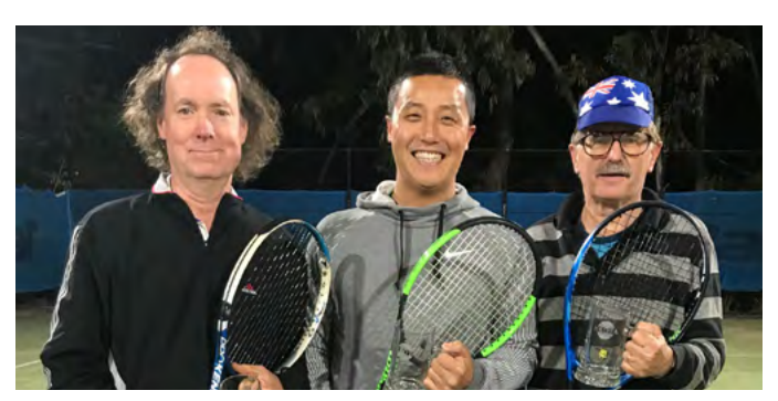
Amalgamated, "Roland Garros" winners of Tuesday Night