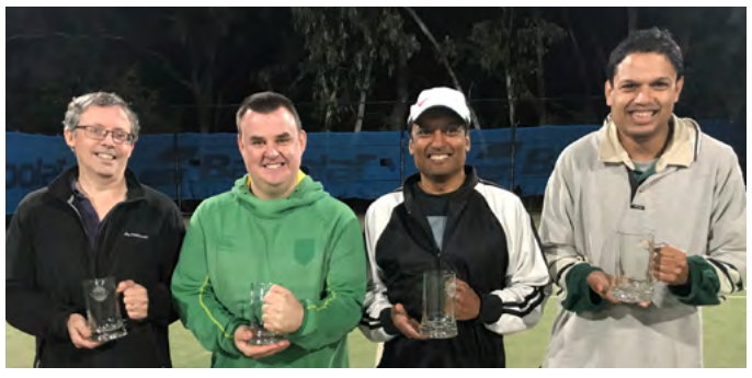
Jet Setters, "Australian Open" winners of Tuesday Night