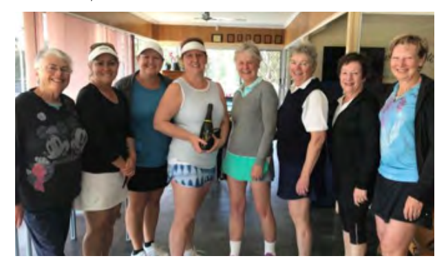
2019 Wednesday Ladies Autumn/Winter Comp Finalists: